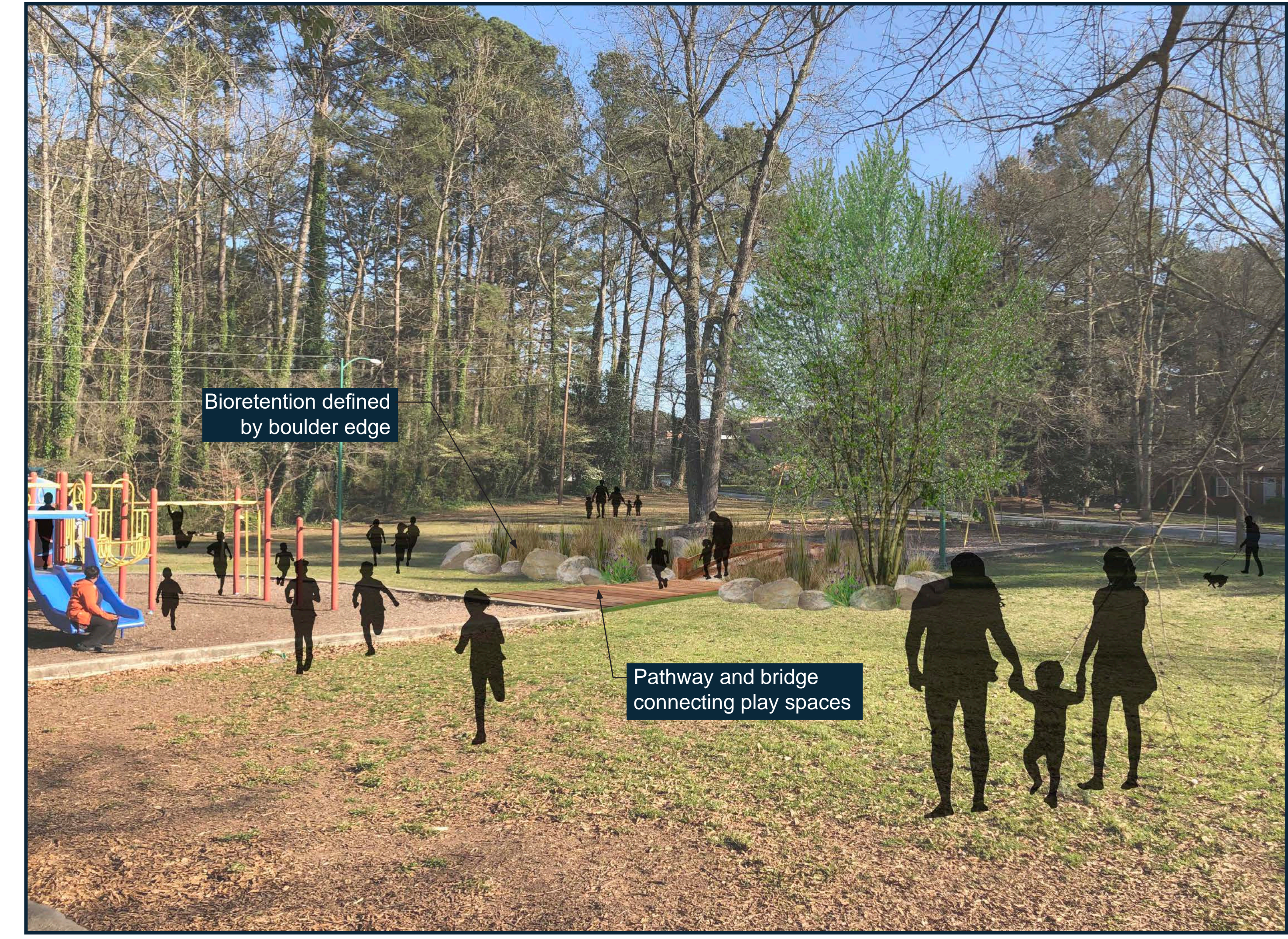
B. Bioretention between play areas