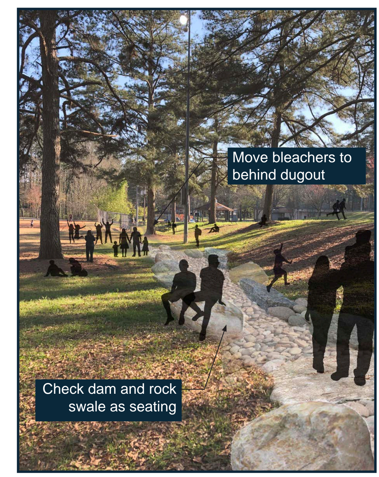
A. Enhanced dry swale