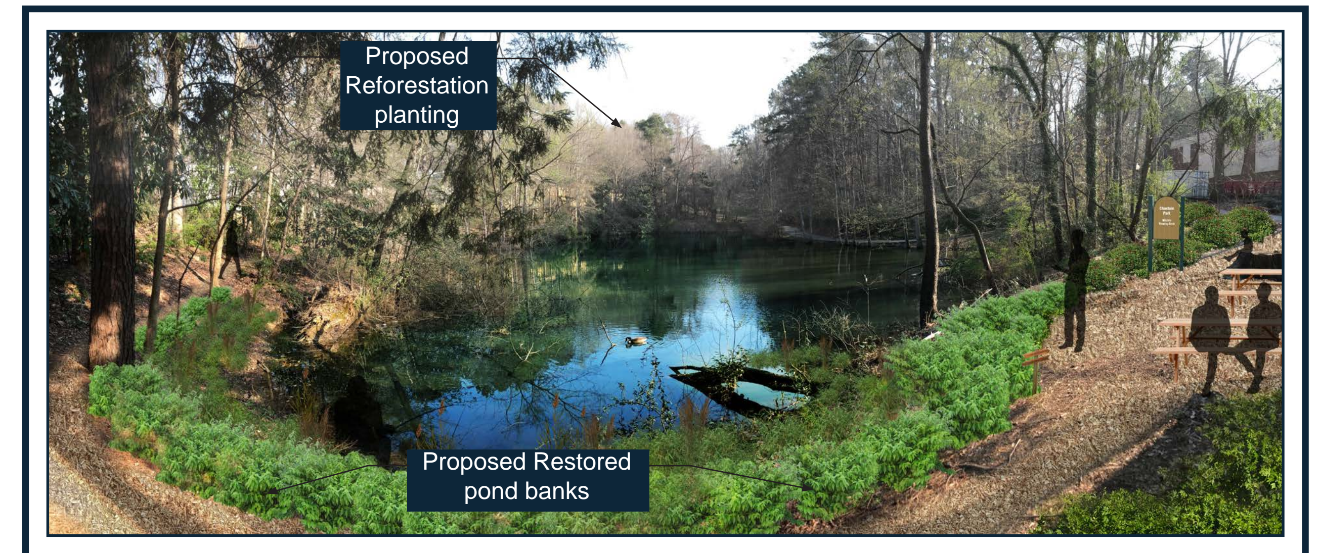
B. Proposed Restoration Planting