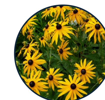
Rudbeckia hirta Blackeyed Susan