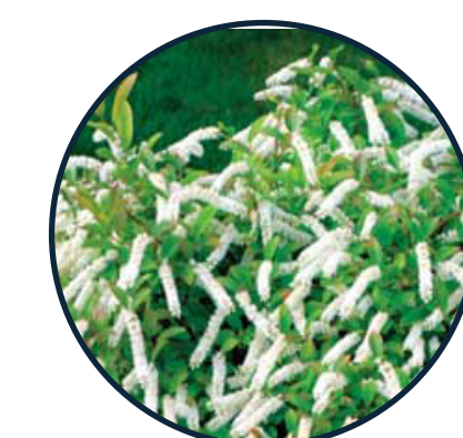
Itea virginica Virginia Sweetspire