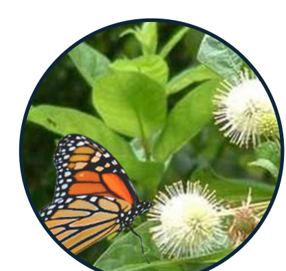
Cephalanthus occidentalis Buttonbush