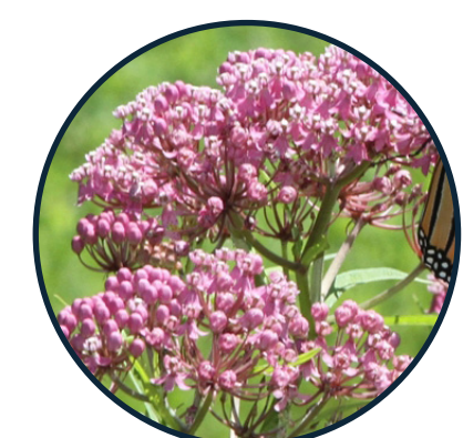
Asclepias incarnata Swamp Milkweed