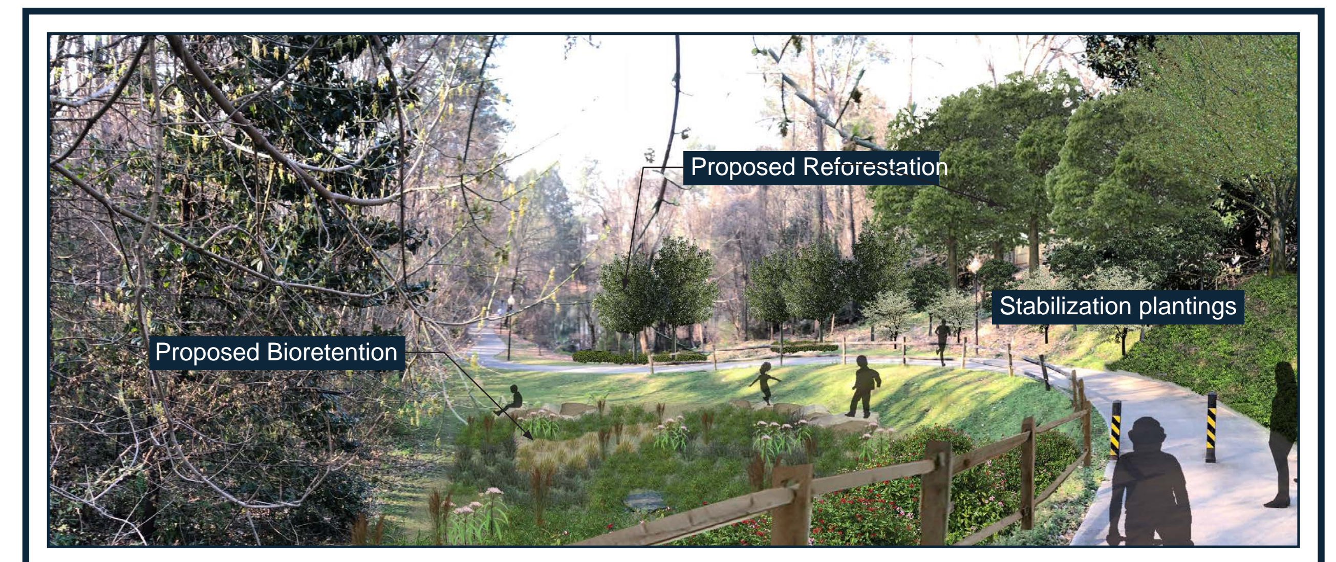
C. View of proposed bioretention pond looking southwest