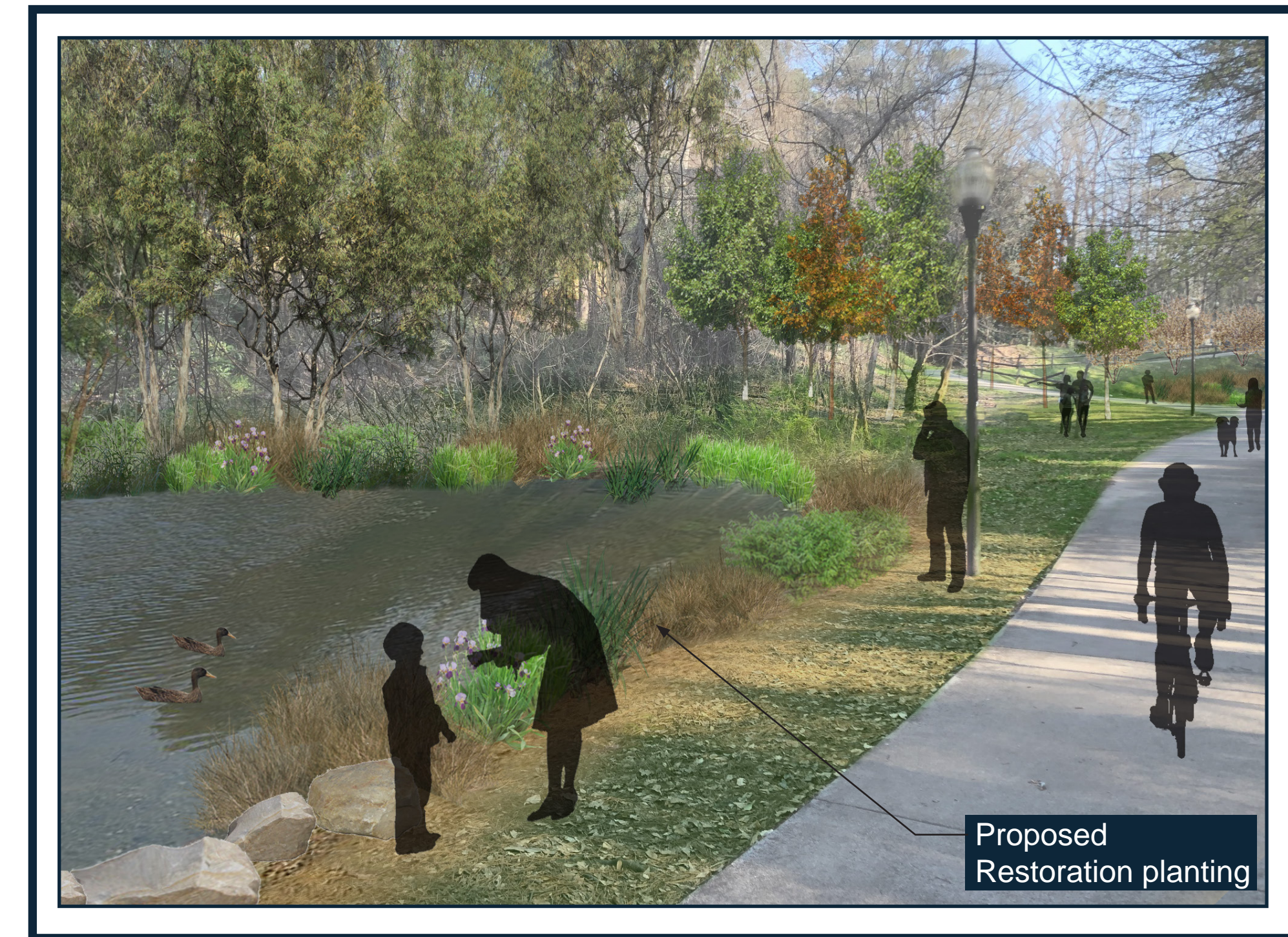
A. Proposed Restoration Planting