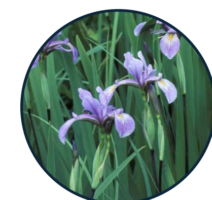
Iris virginica Blue Flag Iris