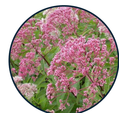
Eupatorium fistulosum Joe Pye Weed