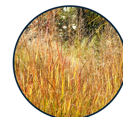
Panicum virgatum Switchgrass