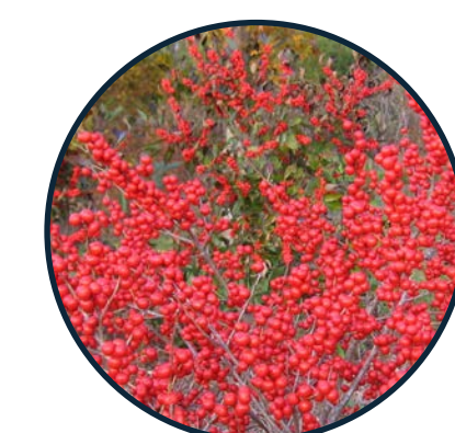
Ilex verticillata Winterberry Holly